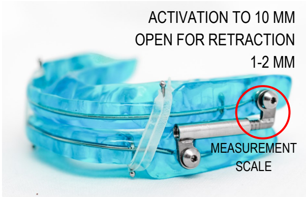
ACTIVATION TO 10 MM OPEN FOR RETRACTION 1-2 MM