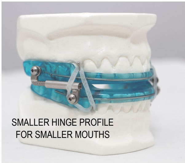
SMALLER HINGE PROFILE FOR SMALLER MOUTHS