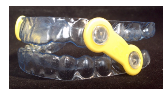
EMA First Step 90 Day Trial Device Includes Three pairs of Yellow Straps for advancement for an additional 4mm.

660 Commerce Drive, Ste. C Roseville, CA 95678 (916) 865-4528 (916) 872-9569 www.dreamsystemsdentallab.com